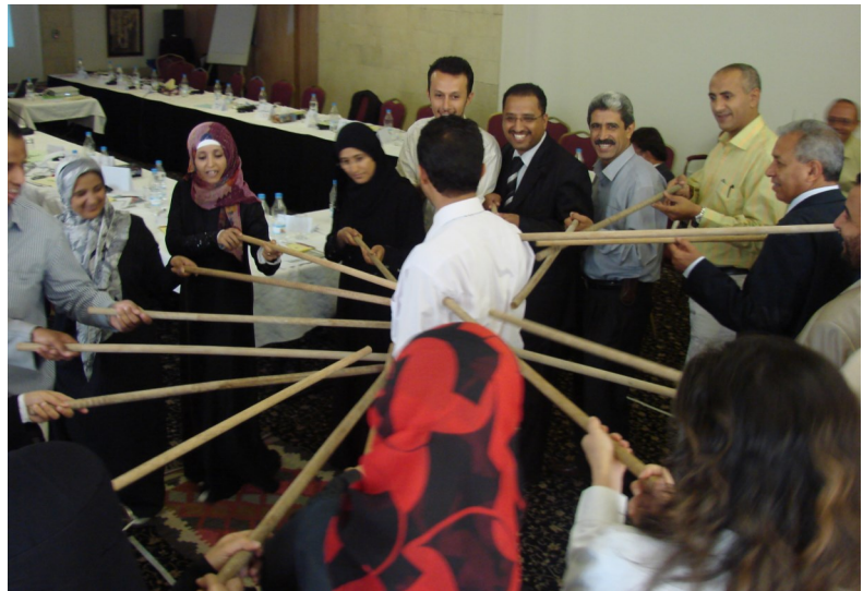
Partners Yemen workshop with community facilitators