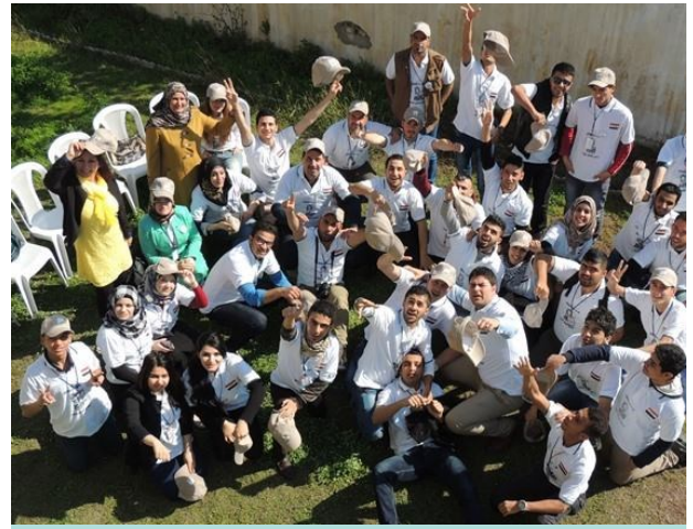
Youth “Champions of Peace” participants in Baghdad, Iraq

Partners, in cooperation with Baghdad-based local partner Iraq 2020 Assembly, is utilizing the power of sports and art to engage disenfranchised, at-risk youth who may be susceptible to violence. Through this effort, Partners is training young men and women from 10 Iraqi provinces in negotiation, mediation, and consensus building. These “Champions of Peace” also receive mentoring and small grant funds to launch innovative community service projects. By supporting creative activities and alternatives to violence, this program is helping Iraqi youth take a leadership role in building sustainable peace in their communities.