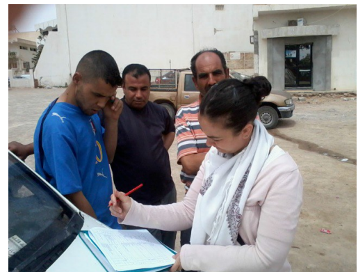
Surveying workers in the Tunisian informal sector

TILI coalition-building workshops prompted labor-related CSOs to combine their efforts around the integration of informal workers. Through the collaboration of all stakeholders, the “Roadmap to Social and Economic Inclusion in Tunisia” was released in 2014 with policy recommendations and suggestions for structural changes within related ministries.